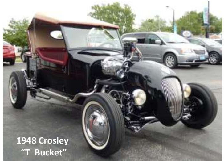
1948 Crosley "T Bucket"

Other firsts; The first production post war American Sports Car, "Hot Shot"; introduced in 1949, four years ahead of the Corvette. Crosley was first to offer four wheel disc brakes on an American built car. In 1947, they were ahead of the truck market by producing the first full-bed or fleet-side style pickup.