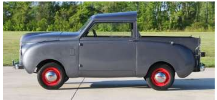
1947 Crosley Pickup Truck