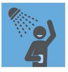
PRACTICE GOOD HYGIENE HABITS