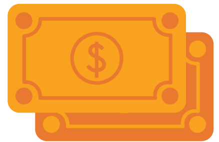
DOUBLE THE IMPACT

We're here to help donors create opportunities for the region's communities and the people who call them home. We're also here to help you serve your clients as they plan for their futures, including their visions for making a difference while maximizing tax benefits.